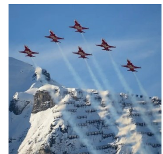
Swiss fighter jets flying over the Alps