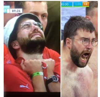
Images of a Swiss national football team fan go viral as a meme

A meme that went viral and socio-political issues surrounding the national team were also discussed. At the Olympic Games, the 'Swiss sweep' in mountain biking in particular, with special mention of Jolanda Neff's gold medal, as well as the performances of tennis players Belinda Bencic and Viktorija Golubic attracted a lot of attention. Bern Young Boys' unexpected victory over Manchester United in the first match of the UEFA Champions League group round received a lot of attention in international media as well as on social media. This unusually big coverage helped to raise the profile of qualities that are otherwise rarely associated with Switzerland – such as athletic performance in various disciplines and public display of emotions. This added some nuances to the classic pattern of how people perceive Switzerland.