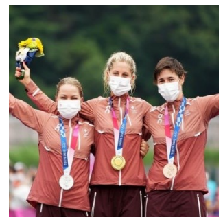
Swiss sweep: three Swiss athletes on the Olympic podium