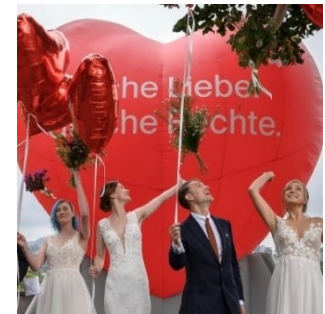
The referendum on marriage equality was depicted internationally in particular via its proponents' activities